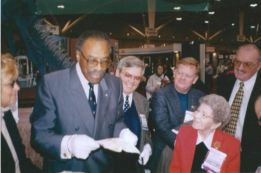
Cornerstone opening – Dec. 2, 1999