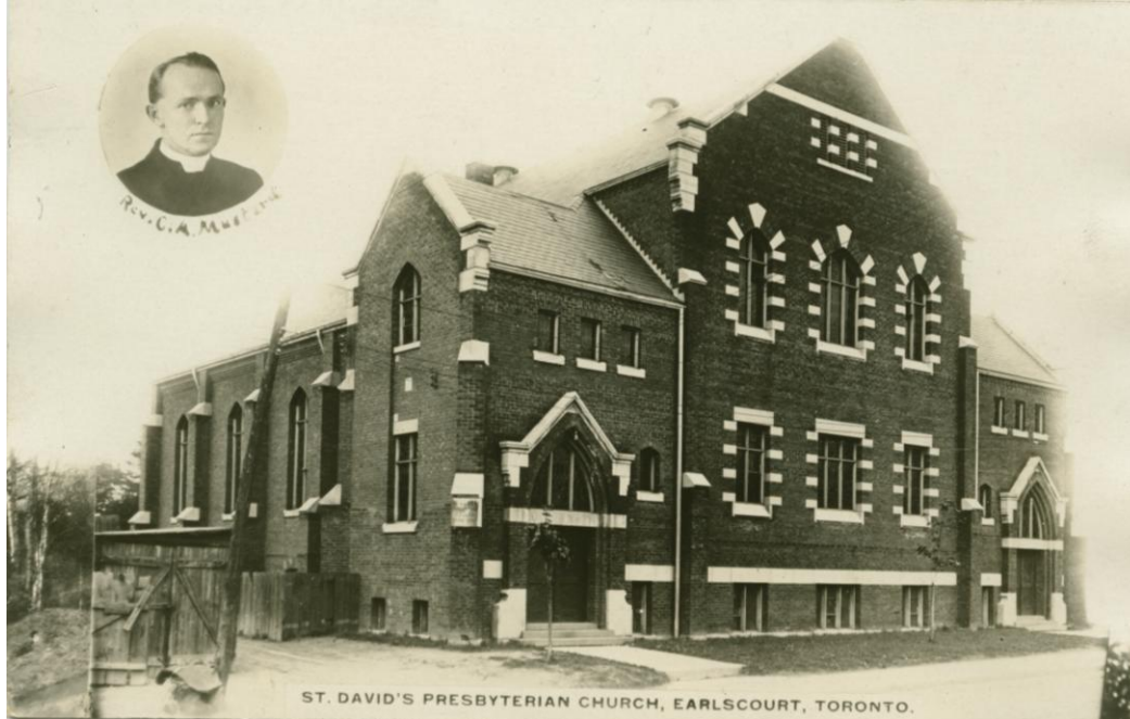
St. David's Presbyterian Church, Toronto (Earls Court Subdivision)