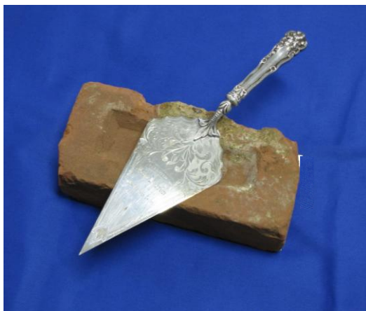
Silver-plated trowel used at the cornerstone laying of St. David's Presbyterian Church on June 15, 1918

Accession No. 1995.001/12