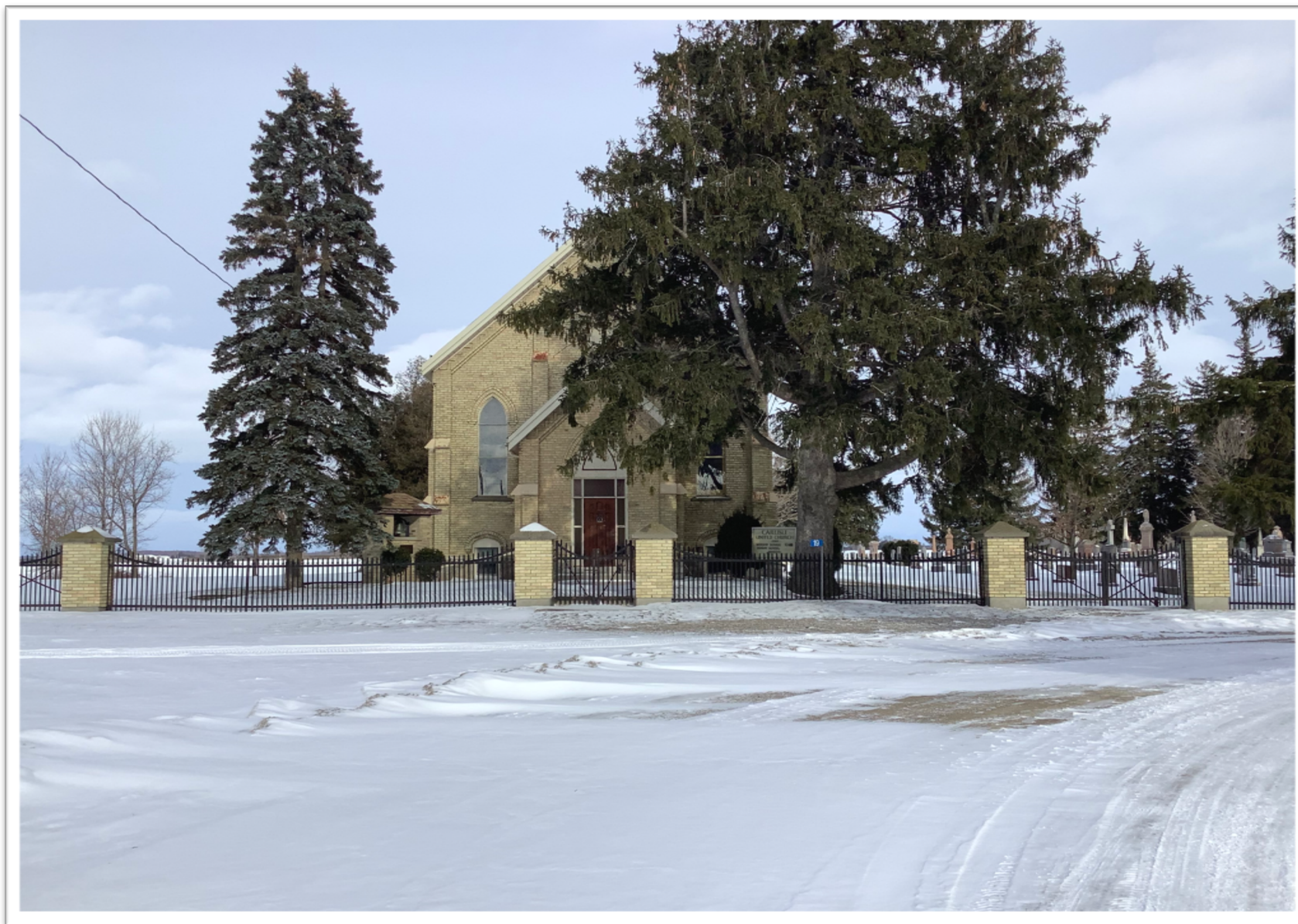
Carlisle United Church last winter.